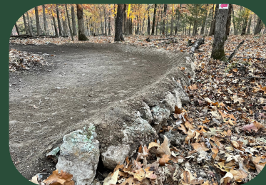
Magic Dragon Trail