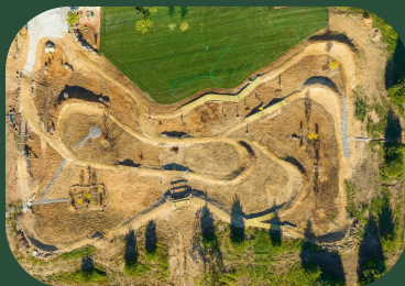
Magic Dragon Skills Park