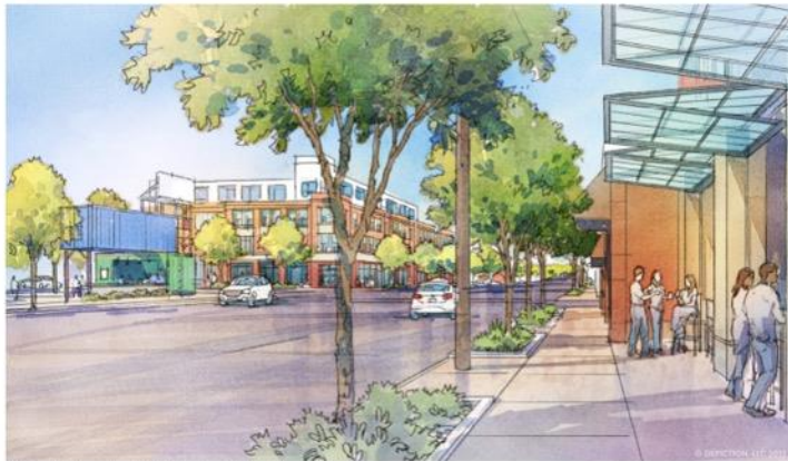
Broad Street at 26th, Looking South