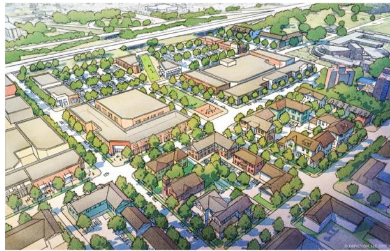
Urban Retail Cluster between 25th Street & I-24