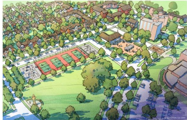
Harris Johnson Park - Southside Gardens