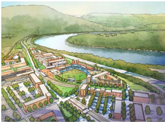
Foundry Site - Entertainment + Mixed-Use